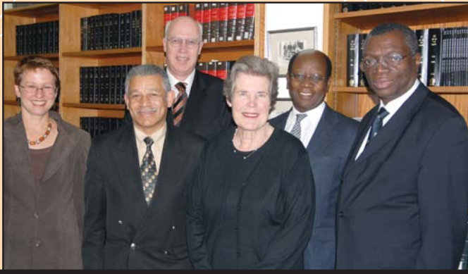
Hoofregter Pius Langa (heel regs) het op 9 Oktober 2006 'n lesing in die Ou Hoofgebou gelewer getiteld: Transformative Constitutionalism. Die volledige lesing is elektronies beskikbaar by http://law.sun.ac.za/LangaSpeech.pdf